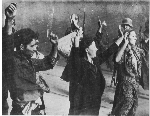
Warsaw ghetto defenders led to execution